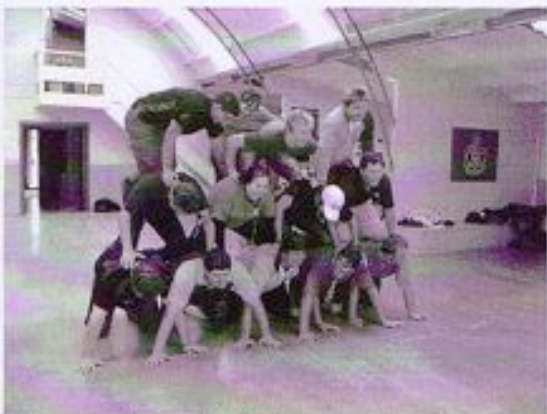
Human Pyramid that was more a square.