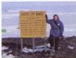
By far the best Venturer trip away!