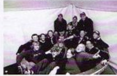
C-Jam Host Corps at their best.